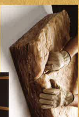
Cutting is easy